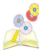
CD For Sale